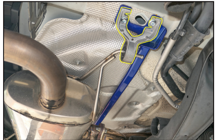
See figure 1 (參考圖表一)