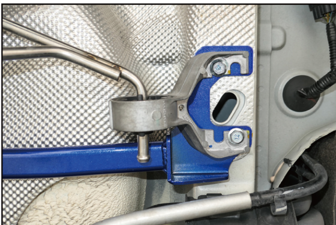
See figure 2 (參考圖表二)