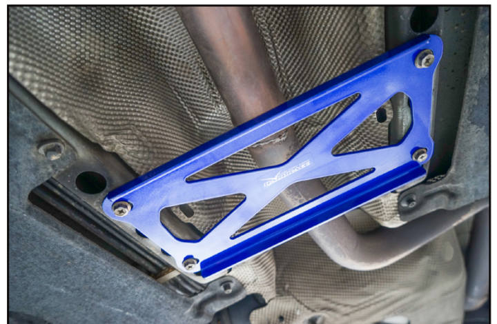
Illustration of installed state 安裝完成示意圖