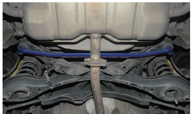
Illustration of installed state 安裝完成示意圖