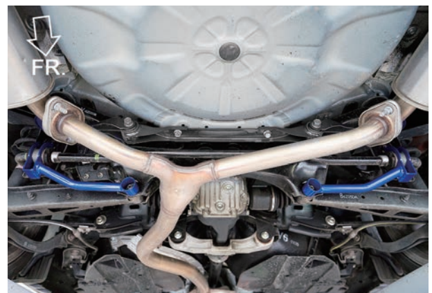
Illustration of installed state 完成示意圖

依照圖表放置 ①後防傾桿拉桿-右 及 ②後防傾桿拉桿-右，並沿用原螺絲將拉桿鎖上。